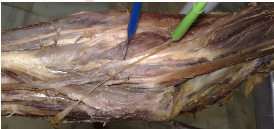
Fig. 2: Showing Accessory slips insertion into the main brachialis muscle.