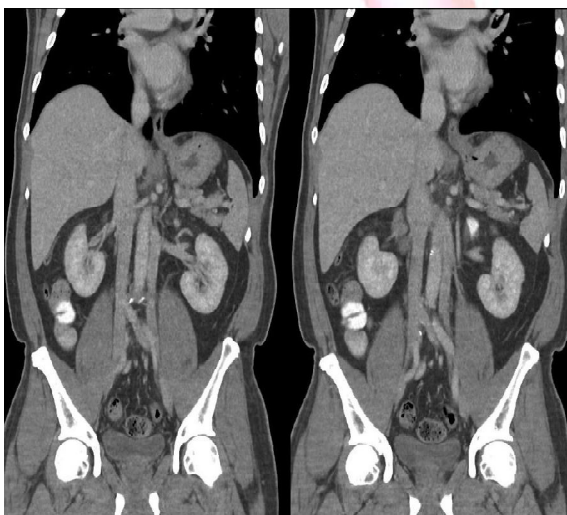
Figure 2: Coronal views of a CT scan showing double inferior vena cava in an asymptomatic patient. The variation is very similar to figure 1, with the duplicated left IVC originating from the left common iliac, terminating at the left renal vein which joins the right IVC by crossing anterior to the abdominal aorta.

Case 2: A 59 year-old man underwent a staging CT scan as part of the pre-operative work-up for radical prostatectomy after a positive biopsy for prostatic adenocarcinoma. The scan revealed an incidental finding of a double inferior vena cava, similar to the one described in Case 1. The duplicated left IVC can be seen originating from the left common iliac vein, terminating at the left renal vein, which then joined the right IVC via a pre aortic trunk as above. Both common iliac veins were connected by a venous anastomosis (Figure 2).