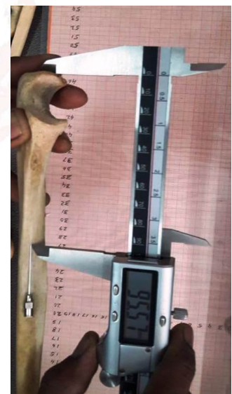
Fig. 2: Measuring from proximal end