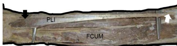
Fig. 1: Anomalous palmaris inversus muscle found during cadaveric dissection.