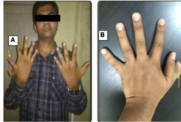
Fig. 11: A. Adult male 24 yrs old with post axial polydactyl of right hand. B.Preaxial polydactyl on left hand.

Adult male of 45years old, split hand syndrome A) Right upper limb: arm is formed, with short forearm and hand with three digits, absence of index and ring finger B) left upper limb: arm is formed, partially formed forearm with lobster claw hand (Fig. 9).