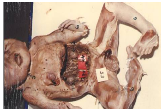
Fig. 2: Male fetus: Upper Limbs with meromelia, hands attached to the partially development forearms. Normal lower limbs with inverted feet (Talipes equinovarus).

Apert's syndrome: Female fetus of 30 – 32 weeks with asymmetrical skull. Hands had syndactyly of 2 nd , 3 rd , 4 th and 5 th digits. Feet had syndactyly of 2 nd , 3 rd and 4 th toes. Detailed internal autopsy was done. Not associated with any anomalies (Fig. 3).