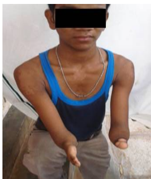
Fig. 10: Adule male (Meromelia): Upper Limbs- arms are present, forearms are absent, right hand syndactyly with fused 2 digits and left hand is completely absent.

Achondroplasia(ACH): In the family, two brothers and one sister with 3' – 3' 4" height. Both extremities are very short, large head with flat nasal bridge. ACH is inherited autosomal dominant present in 1 per 20,000 live births. ACH