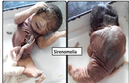
Fig. 5: Lower limbs fused with one femur, one tibia, no fibulae, no tarsal bones, only with on metatarsal and one toe (inverted).

Female Fetus 18-20 weeks of gestation with Arnold Chairii syndrome type II associated with Spina bifida and club feet (Fig. 6).