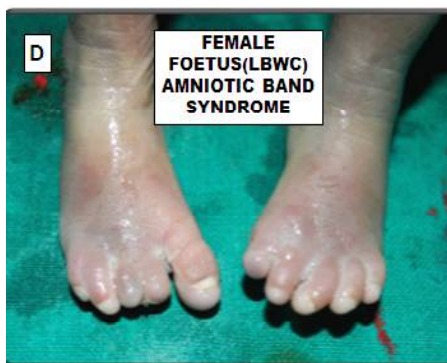
Fig. 4D: Right foot syndactyly of 4 th and 5 th toes and 2 nd and 3 rd toes with amputation of terminal phalanx., Left foot amputation of terminal phalanx of great toe and inversion of 3 rd and 4 th toes.

Lower limbs: Amniotic band syndrome: Right foot syndactyly of 4 th & 5 th toes and 2 nd & 3 rd toes with amputation of terminal Phalanx. Left foot amputation of terminal phalanx of great toe & inversion of 3 rd & 4 th toes (Fig. 4 D).