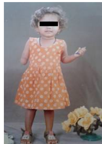
Fig. 12: Female child 4 years old: Amniotic band syndrome right upper limb with absence of forearm and hand. Other three limbs are normal.

Adult male 20 years old (Meromelia): upper limbs: arms are present, forearms are absent, right hand syndactyly with fused 2 digits and left hand is completely absent (Fig. 10).