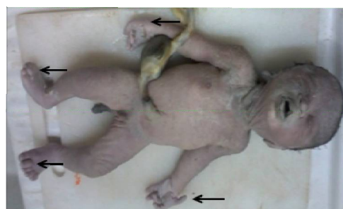
Fig 7: Fetus with omphaloccele right thumb absent, left thumb hyper extended, bilaterally macrodactyly (digital gigantism) of second toe.

Fetus with omphalocele. right thumb absent, left thumb hyperextended, bilateral macrodactyly (digital Gigantism) of second toe (Fig. 7).