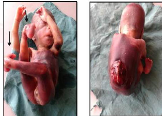
Fig. 6: Arnold chiarii Syndrome type-II with spina bifida and clubfeet.

Fetus with omphalocele. right thumb absent, left thumb hyperextended, bilateral macrodactyly (digital Gigantism) of second toe (Fig. 7).