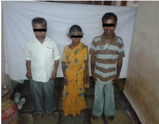
Fig. 13: Achondroplasia: in the famil, 3' -3.4' height with short extremities.

is also known as short limb dwarfism (Fig. 13).