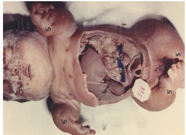
Fig. 1: Female fetus with phocomelia, rudimentary hands and feet were attached to the trunk.

Meromelia: Male fetus of 28 – 32 weeks - upper limbs with meromelia, hands attached to the partially developed forearms. The lower limbs were normal with inverted feet (talipes equinovarus). Internal dissection of abdominal organs was normal (Fig. 2).