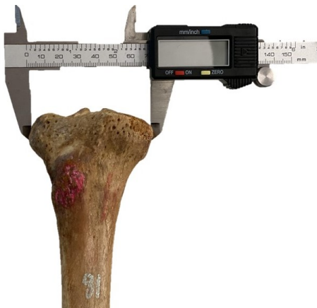
Fig. 1: Measurement of mediolateral length of proximal end of tibia.

The mean and standard deviation of parameters measured, standard error of estimate and coefficient of determination and the Pearson's coefficient is mentioned in the table 1, 2 and 3 respectively.