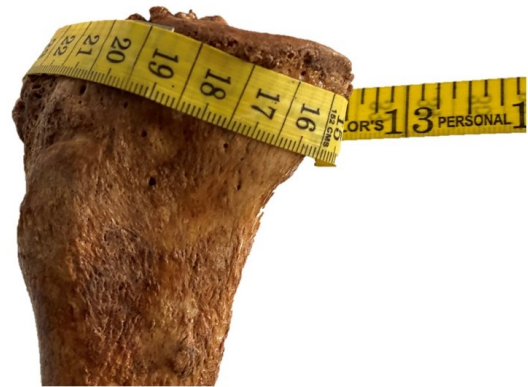
Fig. 3: Measurement of circumference of proximal end of tibia.